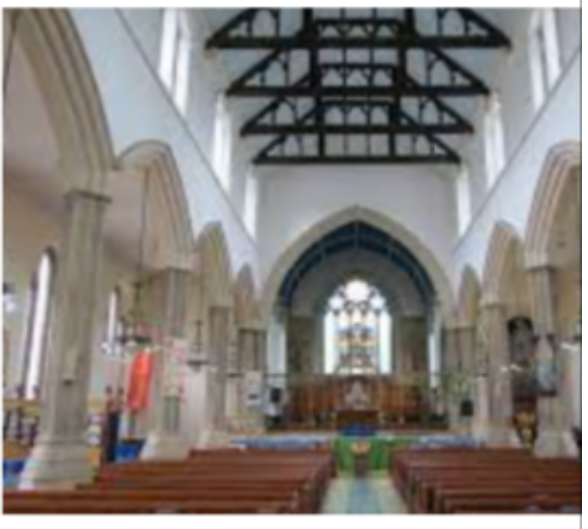
St Johns Church