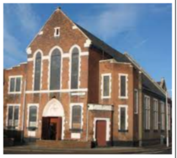
Grace Baptist Church