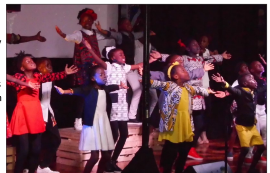
Watoto children's choir performing for us. The little boy at the front right is just 7 years old!

All the children are orphans and have been raised by adoptive mothers funded by the Watoto project. Many of them having lost their parents in the war that has blighted the north of that country. What was so inspiring for us was how these exceptional children have overcome their terrible start in life to become talented, articulate, fulfilled individuals. We were privileged to host them. Thank you to those families who sent in a donation for us to pass onto the project.