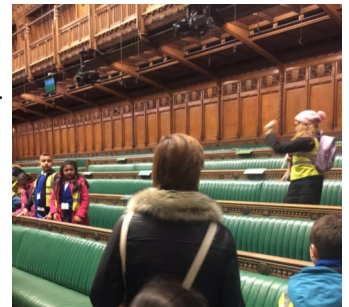
A Year 4 group photographed in the historic House of Commons

An enormous amount of learning happens during these trips, as the children's work reflects, when they do follow-up work in school afterwards. If you were a parent escort on any of our trips, thank you for your help and we hope you also found the trip enjoyable and informative.